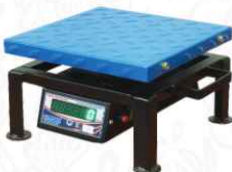
CM-1, 2, 3, 4, 5, 6