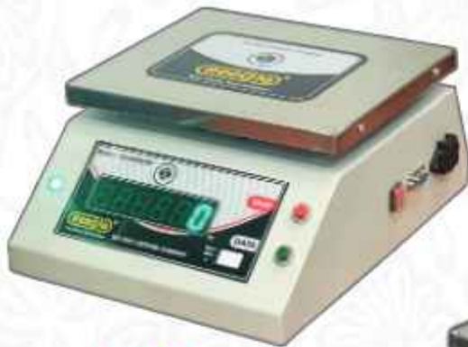
PMS-1 200 x 250mm Premium Model (Pazhamudir)