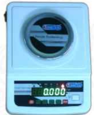
AB - 1