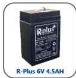
R-Plus 6V 4.5AH