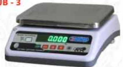
JB - 3