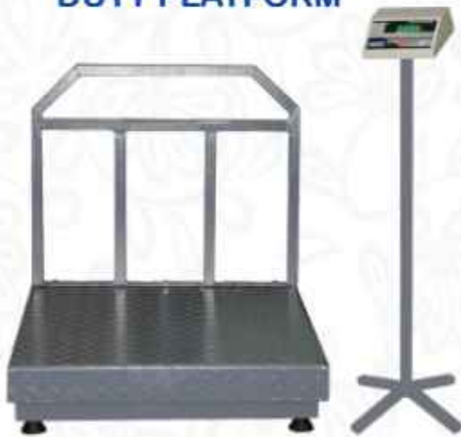
PB - 26 CP 750 x 750mm