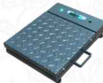
PB - 50 Personal Scale - Heavy 350 x 350mm 200kg - 100g