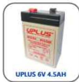
UPLUS 6V 4.5AH