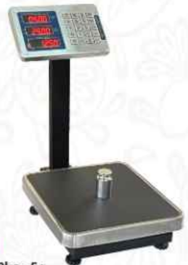
TB - 21 300 x 340mm 50kg - 5g