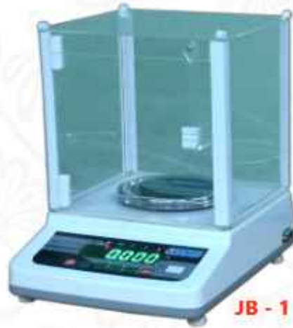
JB - 1