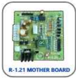
R-1.21 MOTHER BOARD