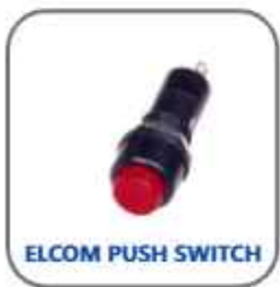
ELCOM PUSH SWITCH