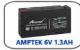
AMPTEK 6V 1.3AH