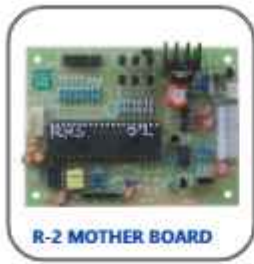
R-2 MOTHER BOARD