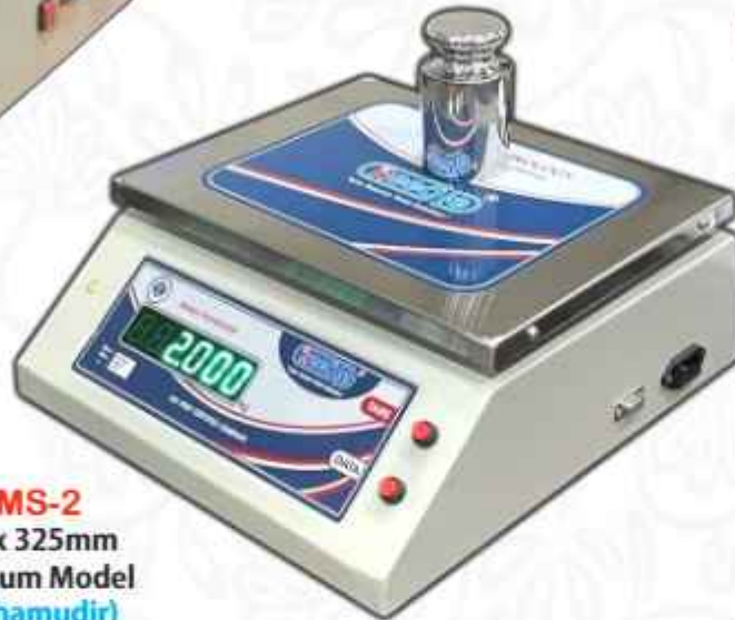
PMS-2 250 x 325mm Premium Model (Pazhamudir)