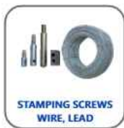
STAMPING SCREWS WIRE, LEAD