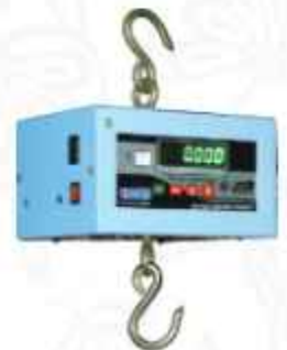
TB - 46 Hanging Scale 50,100,150kg - 5,10,20g