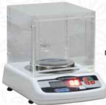
R-1 Mother Board (65,000 Counts)