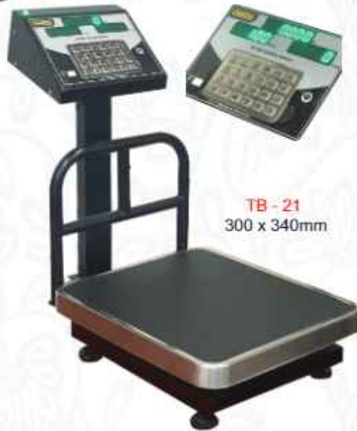
TB - 21 300 x 340mm