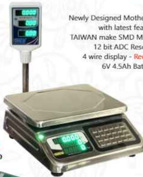
TB - 19 SS 250 x 300mm SS DPRC-24

India's First Manufacturing Company in Metal Keypad Based 3 Window Price Computing Scale Piece Counting Scale Litter Weighing Scale