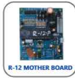
R-12 MOTHER BOARD