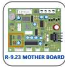
R-9.23 MOTHER BOARD