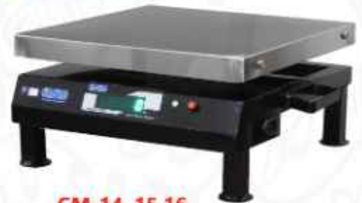
CM-14, 15,16 SS Top Pan