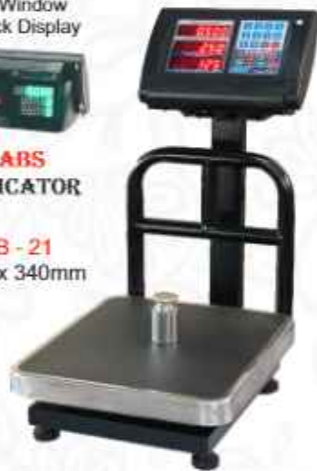
TB - 21 300 x 340mm