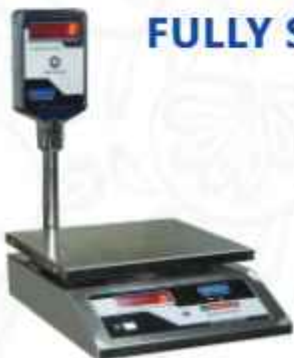
TB-12 250 x 300mm 30kg - 5g