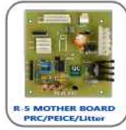
R-5 MOTHER BOARD PRC/PEICE/Litter