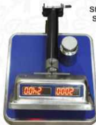
Y-20 TB - 23 230 x 330mm PRC K-3