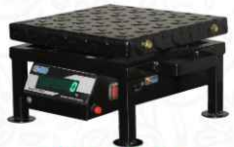
CM-10, 11, 12, 13, 14 CP Top Pan