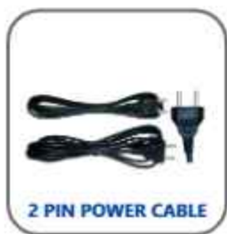
2 PIN POWER CABLE