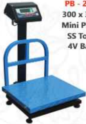
PB - 20 ECM 300 x 350mm Mini Platform SS Top Pan 4V Battery