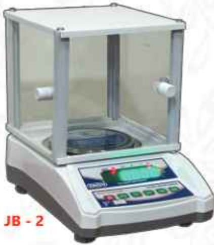
JB - 2