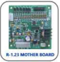
R-1.23 MOTHER BOARD