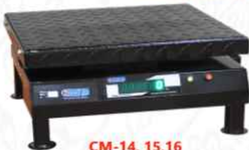
CM-14, 15,16 CP Top Pan