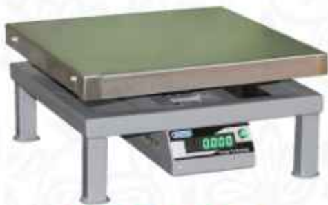
CM-10, 11, 12, 13, 14 SS Top Pan