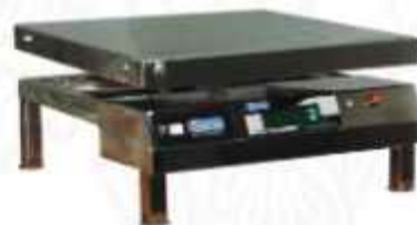
CM REEGLE Model 400x400mm - 500x500mm 600x600mm