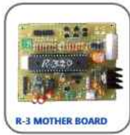
R-3 MOTHER BOARD