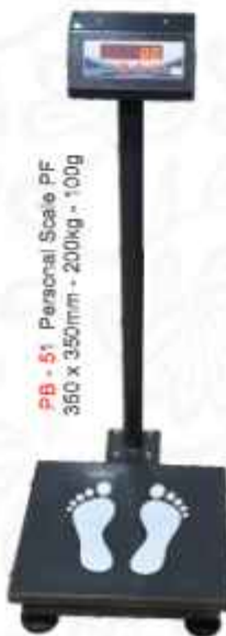
PB - 51 Personal Scale PF 350 x 350mm - 200kg - 100g