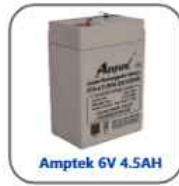
Amptek 6V 4.5AH