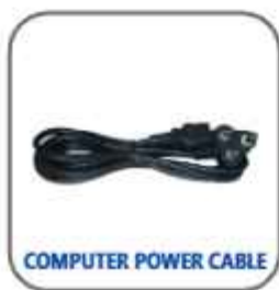
COMPUTER POWER CABLE