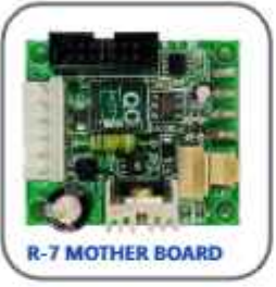
R-7 MOTHER BOARD