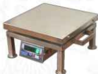
CM ECM Front and Back 250x250mm - 300x300mm 400x400mm - 500x500mm 600x600mm