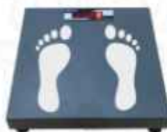
PB - 49 Personal Scale 300 x 300mm 150kg - 100g