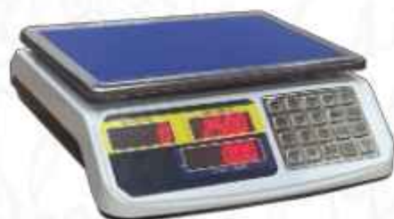
20kg - 2g 30kg - 5g