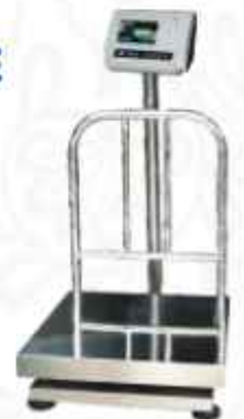
PF ABS & SS Indicator 400x400mm - 500x500mm 600x600mm 50,100,200,300,500kg