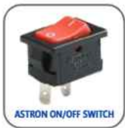
ASTRON ON/OFF SWITCH