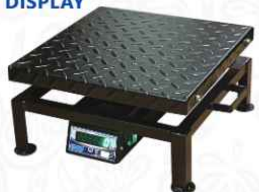
CM-1, 2, 3, 4, 5, 6, 7, 8, 9