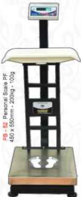
PB - 52 Personal Scale PF 450 x 550mm - 200kg - 100g