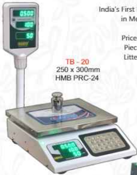
TB - 20 250 x 300mm HMB PRC-24

India's First Manufacturing Company in Metal Keypad Based 3 Window Price Computing Scale Piece Counting Scale Litter Weighing Scale